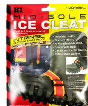
INTRINSIC HIGH PROFILE