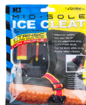
INTRINSIC LOW PROFILE